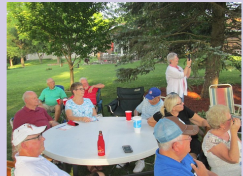
40th ANNIVERSARY BANQUET