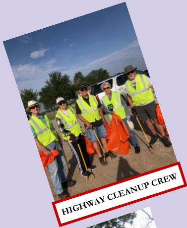
HIGHWAY CLEANUP CREW