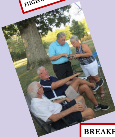
BREAKFAST AT DENNY'S 2018